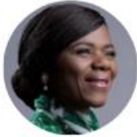
PROFESSOR THULI MADONSELA