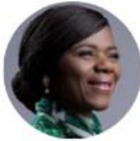
PROFESSOR THULI MADONSELA