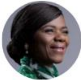
PROFESSOR THULI MADONSELA